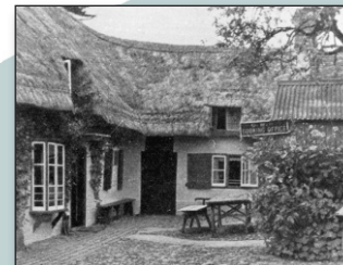
The picturesque ticket office for Wootton Rivers Halt, circa 1940.