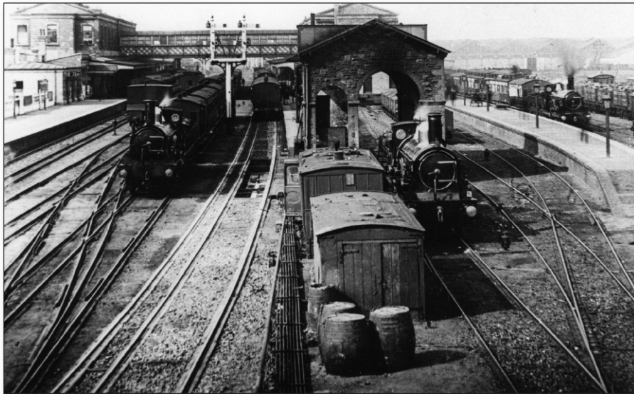
Swindon Junction view down circa 1891.