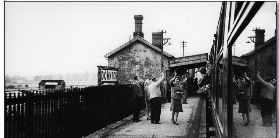
Downton, view towards Salisbury 2 May 1965. (D. Payne)